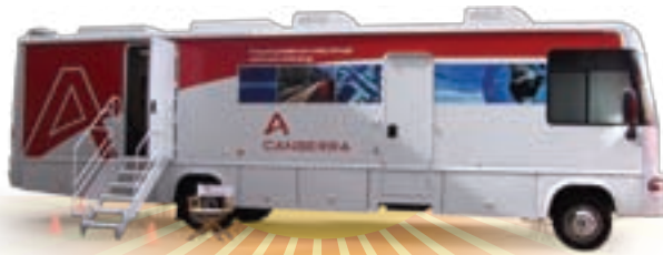
Please visit our CANBERRA Mobile Technology Center outside the hotel